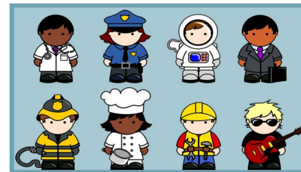
Learning about jobs and places

All children need a white t-shirt, black shorts and change of shoes.